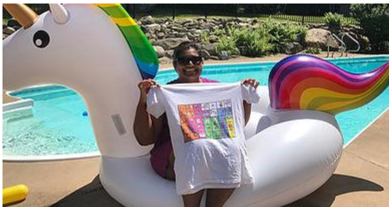
Core boards on t-shirts in action!